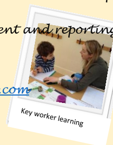
Key worker learning