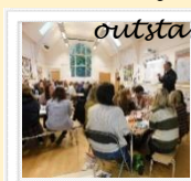
Governor and staff CPD

Further information from www.blackwellfirstschool.com