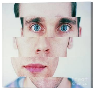
Distorted images – collage