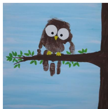
Example handprint animal

The leaves fly off and whirl around, And nuts go tumbling to the ground: Small, brown, hard, round.