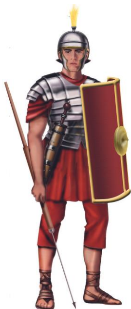
Roman Soldier for writing task