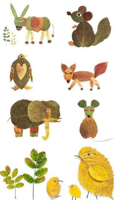
Leaf animals to make and write instructions for

4. Put the baking tray into a cold oven. Ask an adult to turn the oven to 375°C (190°F/ Gas Mark 5). Bake the bread for one hour. Yummy!