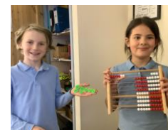
exploring tenths and hundredths in maths – an introduction to decimal numbers