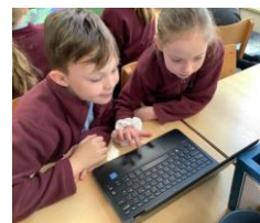
developing our computing skills and always considering how to be safe online