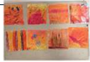
Great Fire Artwork